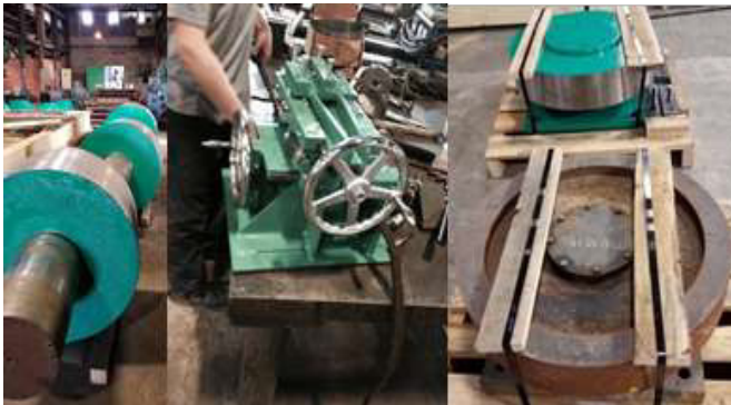
FMT has variety of manufacture, repair & refurbish capabilities for a range of Defense applications

FMT manufactures, repairs, and assembles large equipment parts, components, and systems with expertise in rotary equipment. Our commercial work includes crafting a variety of heavy steel components for rotary kilns, asphalt dryers, waste incinerators, mining equipment, and other large-scale industrial fabrications. Not only is FMT a leader in producing large wheels/tires, shafts, thrust rollers, and trunnions, we also manufacture numerous categories of heavy-duty equipment and make parts ranging from inches and pounds to feet and tons. FMT's skilled