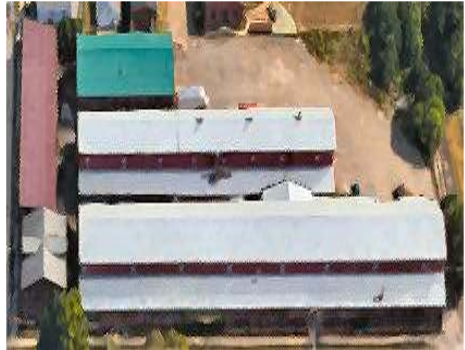
Finch Manufacturing and Technology's 24,000 sq.ft. facility in West Pittston, Pennsylvania

Located in West Pittston, PA, Finch Manufacturing & Technology LLC (FMT) manufactures, fabricates, refurbishes, and repairs components and systems to include numerous categories of large/heavy duty equipment. Our unique machinery, facility, and engineering capabilities enable us to machine or fabricate the LARGEST EQUIPMENT and we have been doing this since 1855 . Over the last few years, FMT has invested hundreds of thousands of dollars into equipment, factory upgrades, and more recently changing ownership to become a Service-Disabled, Veteran-Owned, Small Business (SDVOSB). Our staff of professionals has hundreds of years of management, engineering, and manufacturing experience. We are poised to become a significant presence in the Defense market.